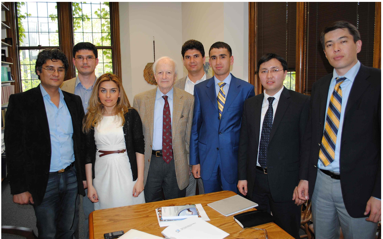
Fellows with Professor Gary Becker of University of Chicago, Nobel Prize winner in economics