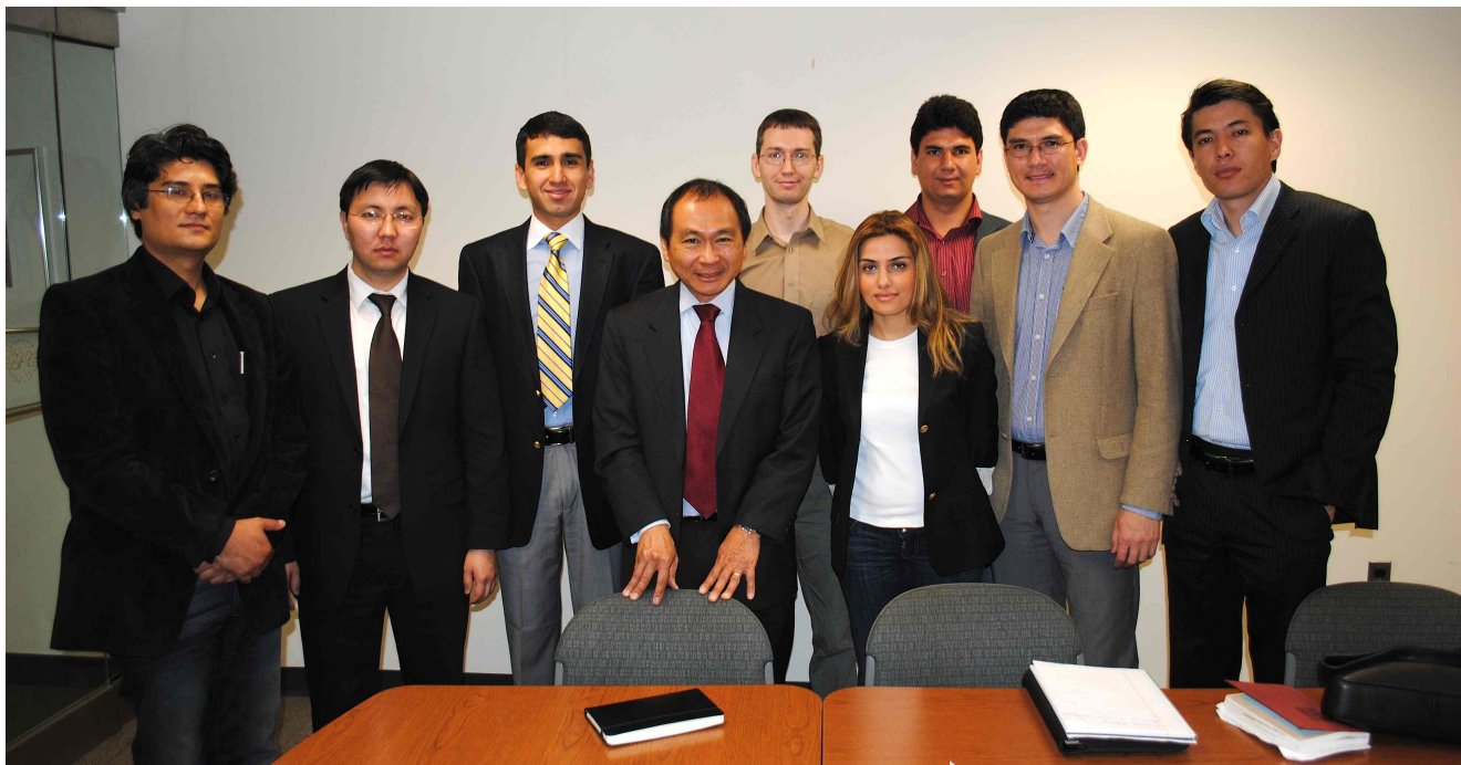
Fellows with Professor Francis Fukuyama, Director of the International Development Program at SAIS

In addition, through arranging individual meetings with relevant officials and experts the fellows were able to focus more specifically on their current research topics in order to accommodate to their professional interests. Finally, at the end of the program the fellows gave a presentation at the Central Asia-Caucasus Institute where the topic of discussion was, "Is Regional Cooperation in the Caucasus, Central Asia, and Afghanistan Happening? Developing?"