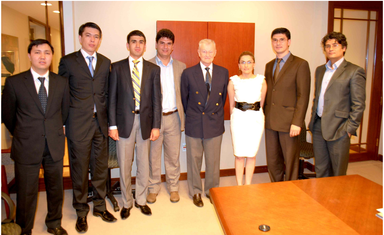
Fellows with Dr. Zbigniew Brzezinski, Counselor and Trustee, Center for Strategic and International Studies