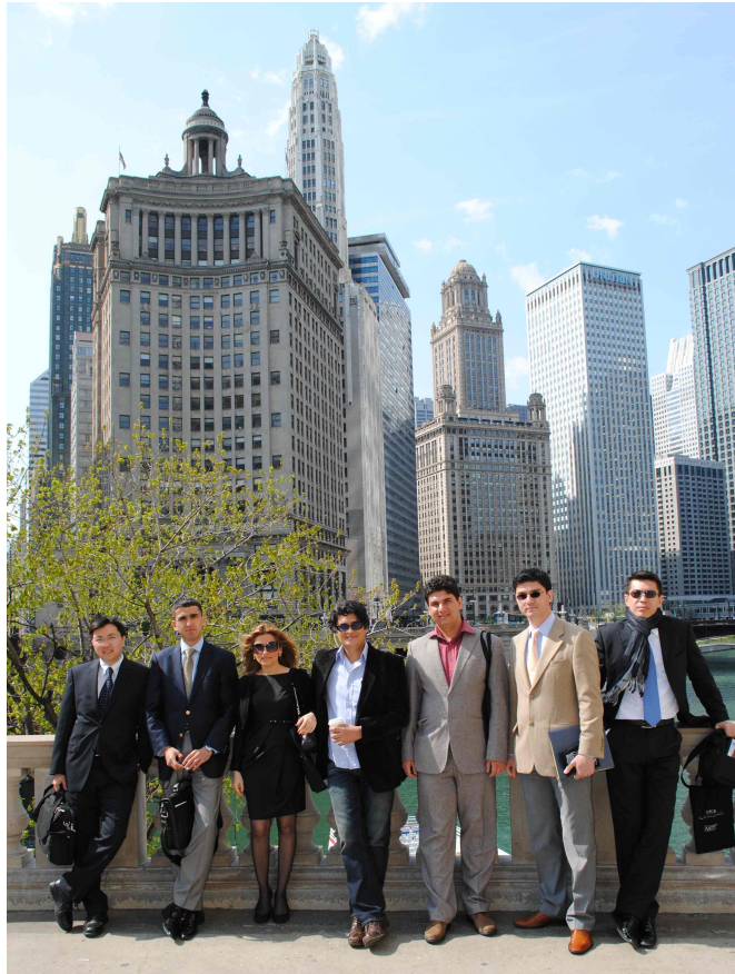
Fellows in Chicago

The group also traveled to Chicago for high-level meetings at the Mayor's office, the University of Chicago, the Chicago Tribune, and local foundations, which offered them a view of the United States beyond Washington.