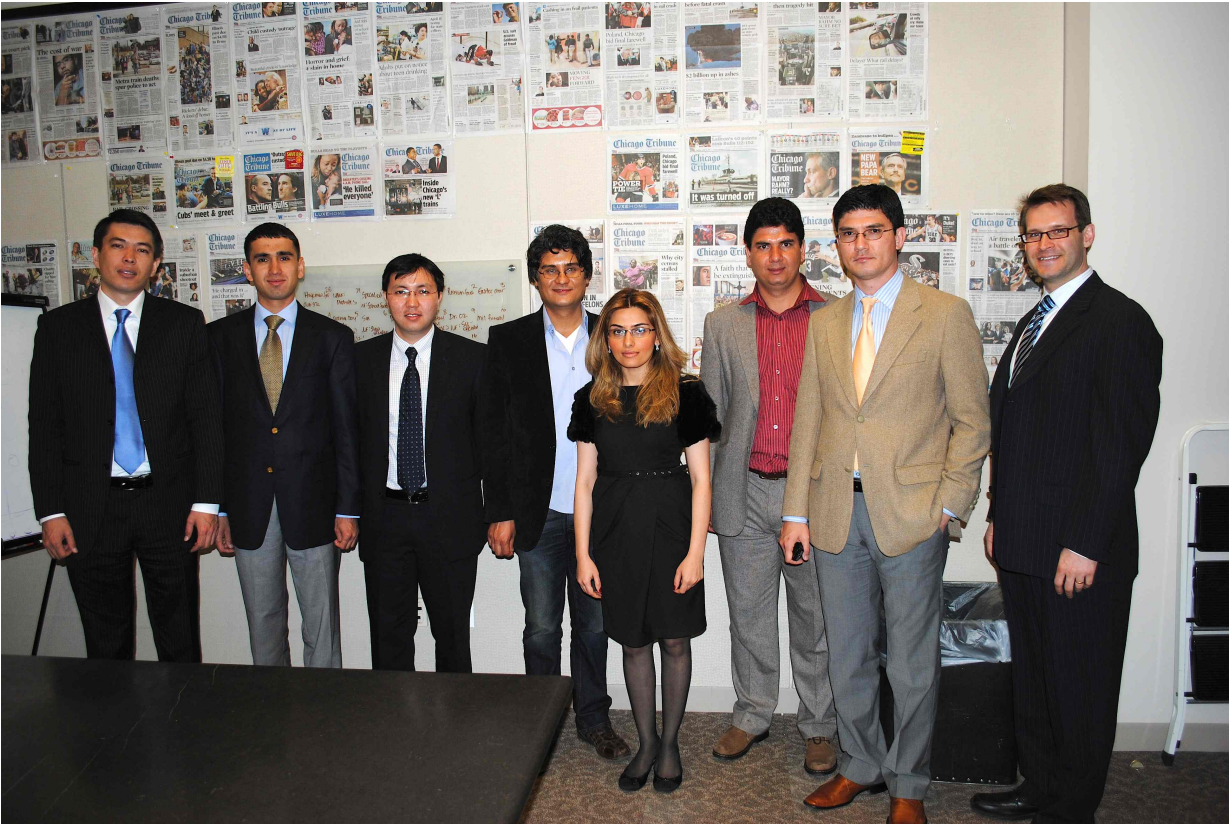
Fellows at the Chicago Tribune