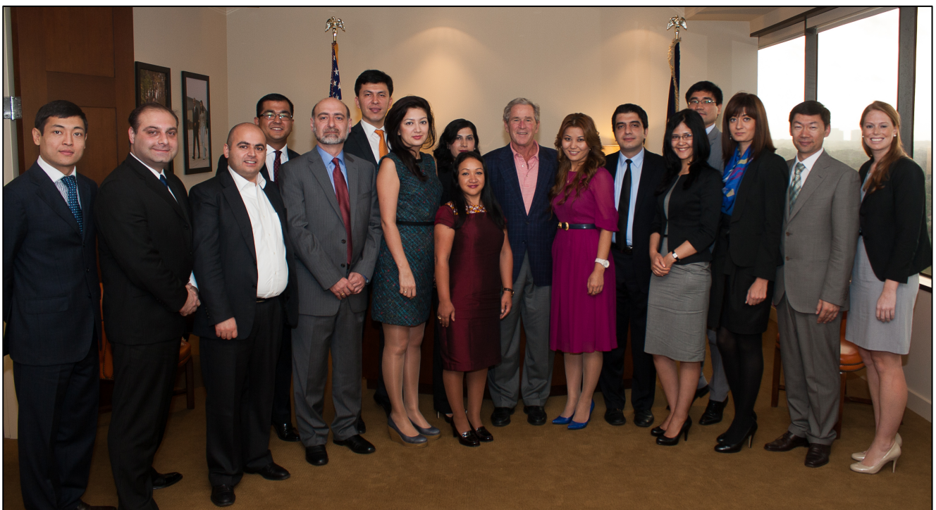
Fellows with George W. Bush, Former President of the United States

Since the fall of 2011, the Rumsfeld Fellowship has partnered with the Open World Leadership Center to organize local programs with host communities outside of Washington, D.C. in an effort to show the fellows American democracy and how businesses and governments work on the local level. This fall the fellows traveled to Tulsa, Oklahoma , and Phoenix, Arizona . The program theme in Tulsa was "Accountable Governance," focusing on how accountable and transparent local governments work with businesses, civil organizations, and individuals to bring benefits to the U.S. economy and society. In Phoenix the program theme was "Immigration," focusing on current state legislation and policy and their various effects on the local communities. The entire group then traveled to Dallas, Texas for meetings at the office of former President George W. Bush, the Dallas/Fort Worth World Affairs Council, and Hunt Oil Company.