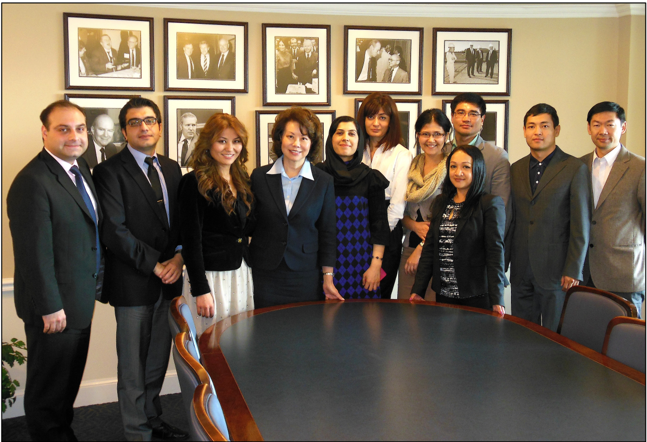
Fellows with Elaine Chao, Distinguished Fellow at the Heritage Foundation and Former U.S. Secretary of Labor