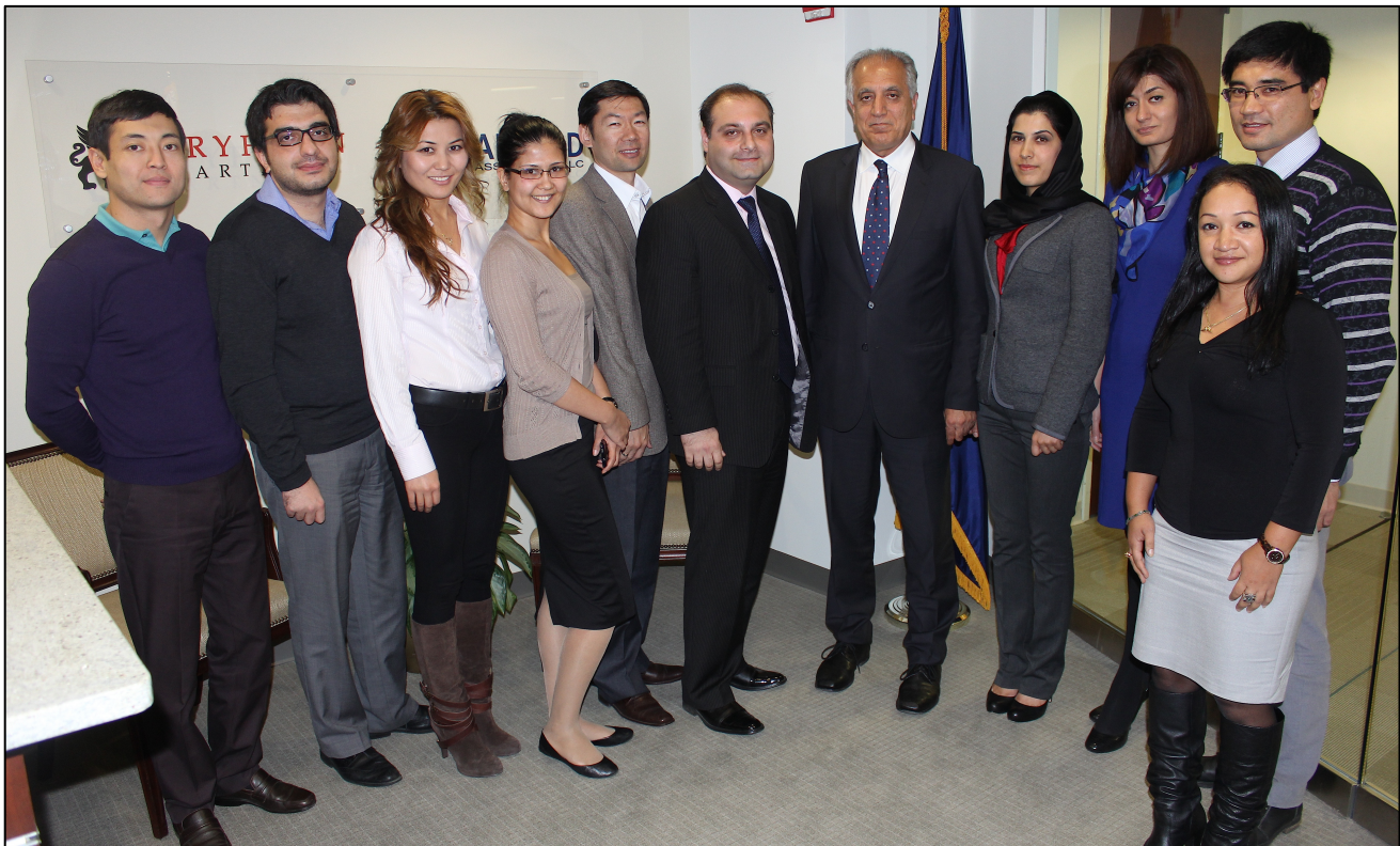
Fellows with Zalmay Khalilzad, Former U.S. Ambassador to Afghanistan, Iraq and Permanent Representative to the United Nations

Afghani Barakzai (Afghanistan): “The Rumsfeld Fellowship program allowed me to meet people who play important roles in the long-term relationship between my country – Afghanistan – and the United States. This program offered true opportunities for cultural exchange and was, as a result, much more than an introduction to American policy. At every turn, the program offered me extra time with civil and community leaders, giving me not only insight into international affairs but local politics, human rights, the role of women in American politics and the practice of democracy in both the United States and Central Asia.”