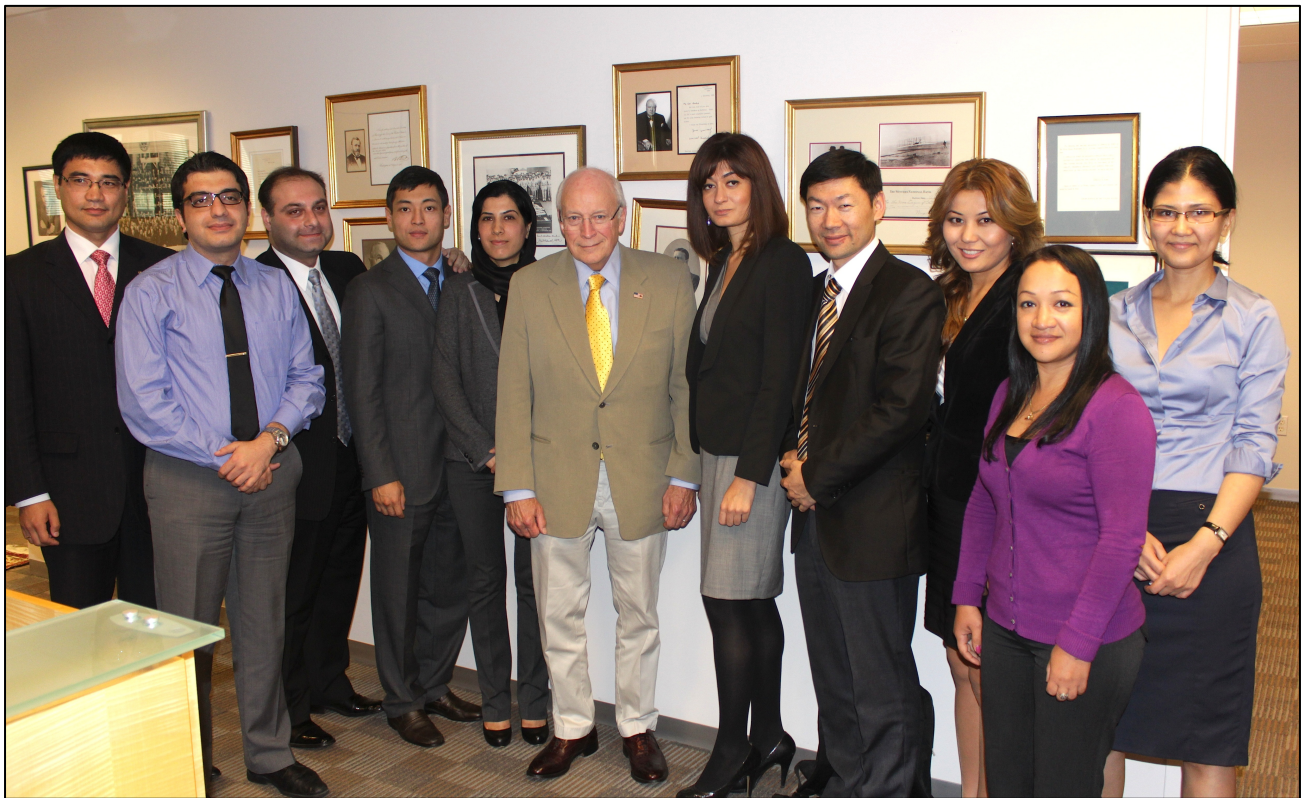
Fellows with Richard B. Cheney, Former Vice President of the United States

In addition, through arranging individual meetings with relevant officials and experts, the fellows were able to focus more specifically on their research topics in order to accommodate their professional interests. Finally, at the end of the program the fellows gave a presentation at the CACI/SAIS where the topic of discussion was “Implications of U.S. Withdrawal from Afghanistan in 2014 on Central Asia, Caucasus and Mongolia.”