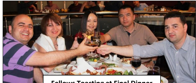
Fellows Toasting at Final Dinner