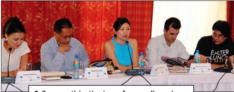
Fellows participating in conference discussions