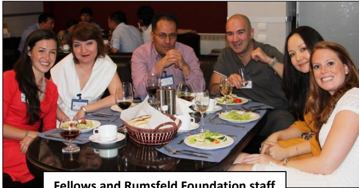
Fellows and Rumsfeld Foundation staff at the Welcoming Reception