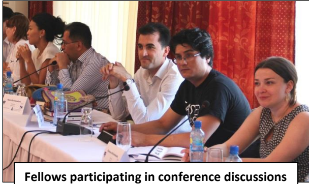
Fellows participating in conference discussions

The reunion consisted of panel discussions, smaller working groups, and cultural activities, with a particular focus on strengthening the fellowship program, the alumni network, and planning for future conferences.