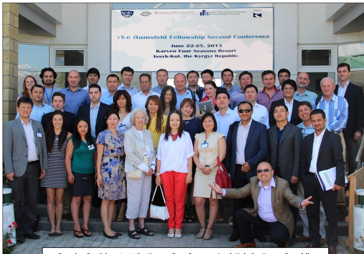
Reunion Participants at the Karven Four Seasons, Issyk Kul, the Kyrgyz Republic

The Foundation hosted the second conference of fellows from its program in cooperation with the Central Asia-Caucasus Institute at Johns Hopkins University's School of Advanced International Studies from June 22-25, 2013 at Lake Issyk Kul, Kyrgyz Republic. Over four days, attendees discussed issues of importance to the Greater Central Asia region as well as ways to strengthen and improve their growing alumni network.