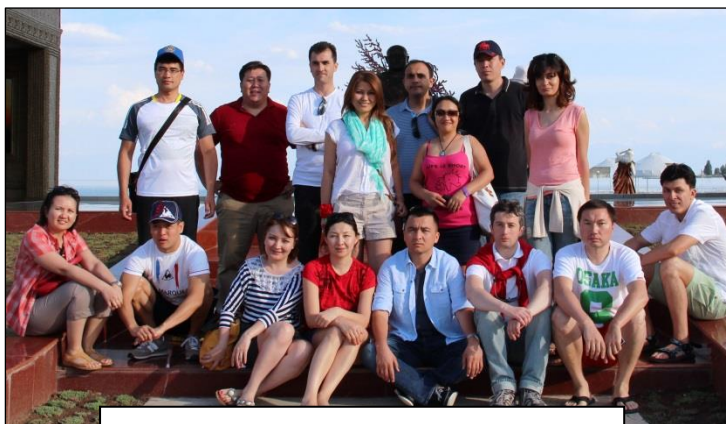
Fellows visiting “Rukh-Ordo” Spiritual Site

The second half of the conference focused on various aspects of the fellowship and network, with an alumni working group stimulating the discussion with ideas and recommendations the group discussed prior to the conference. Over two sessions, reunion participants proposed ideas, discussed, and ultimately came to understandings on actionable items to strengthen the network and improve future conferences. Following these discussions, the Rumsfeld Foundation, Central Asia-Caucasus Institute, and fellowship alumni look forward to advancing the network with these recommendations and goals in mind.