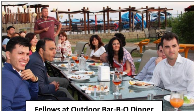
Fellows at Outdoor Bar-B-Q Dinner