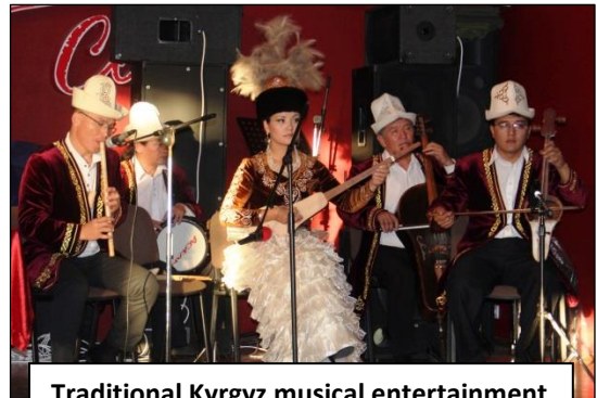
Traditional Kyrgyz musical entertainment