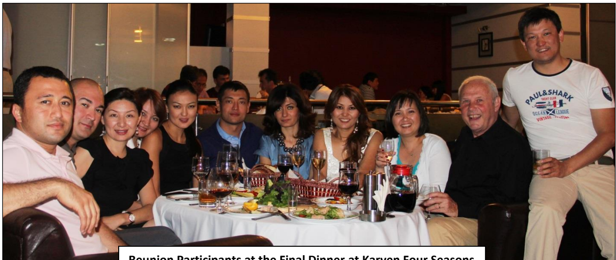
Reunion Participants at the Final Dinner at Karven Four Seasons

Attendees of the conference experienced a productive and memorable meeting of many of the brightest minds and rising leaders of Greater Central Asia. Perhaps the biggest impact of the conference was the inspiration participants felt by having the opportunity to interact with one another, causing all to depart the Kyrgyz Republic with optimism for the future of the region after spending time with such impressive and dedicated talents.