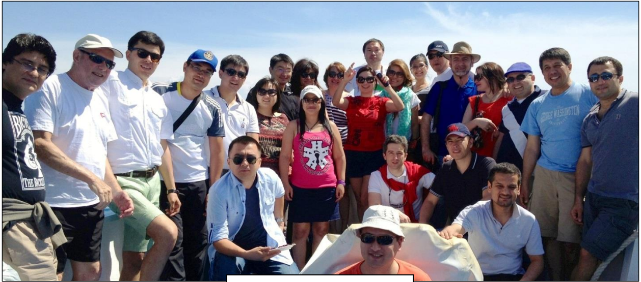
Boat Cruise on Lake Issyk Kul