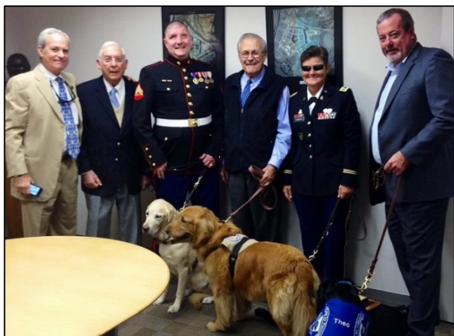
Paws for Patriots visiting the Rumsfeld Foundation in October '13

THE RUMSFELD FOUNDATION HAS DONATED MORE THAN $2.4 MILLION TO CHARITIES FOR OUR TROOPS, VETERANS, AND MILITARY FAMILIES SINCE 2007.