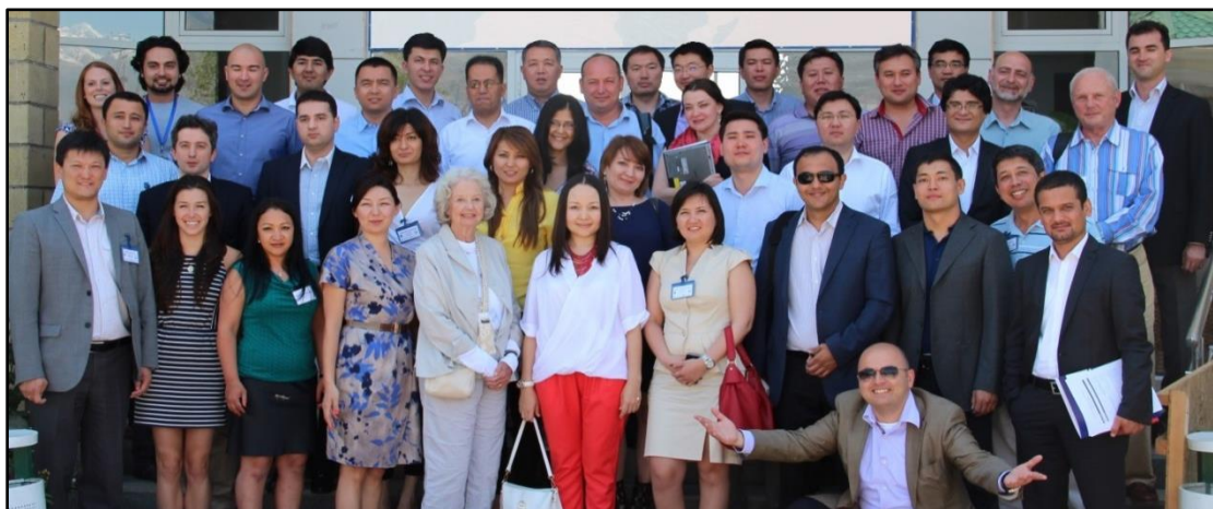
Conference Participants at the Karven Four Seasons, Issyk Kul, the Kyrgyz Republic

After successful conferences in 2012 and 2013, we are fully convinced of the value of providing opportunities for the alumni network to convene and are now in the early stages of planning the next regional Conference for the summer of 2014.