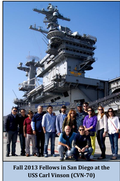
Fall 2013 Fellows in San Diego at the USS Carl Vinson (CVN-70)

This year we continued our important partnership with the Open World Leadership Center , which links our Fellows with host organizations in U.S. cities to enable them to learn more about local governments and communities while staying with host families. In the spring, half of the Fellows visited Charlotte, North Carolina, while others went to Kansas City, Missouri. At the conclusion of their Open World programs, the groups traveled to Atlanta, Georgia for a variety of meetings at Coca-Cola Headquarters. The fall Fellows also participated in Open World programs, traveling to Helena, Montana and Reno, Nevada. They then