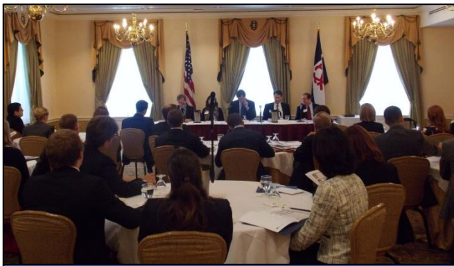
Graduate Fellowship Conference Panel

This September, we hosted our first Graduate Fellowship Conference, bringing together our former and current Fellows from across the country, as well as many of our program’s