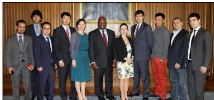
Spring 2013 Fellows with Justice Clarence Thomas