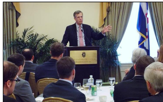
Conference Keynote Speaker, Brit Hume, Senior Political Analyst at FOX News

Following a welcoming reception at our home, there was a panel and a day of discussion which focused on the conference theme, “American Leadership – Tradition and Today.” Brit Hume, Senior Political Analyst at FOX News, spoke and responded to questions at the luncheon.