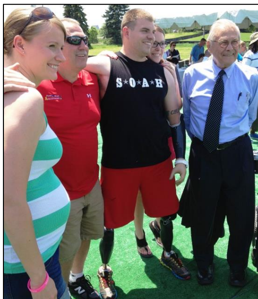
Don Rumsfeld at the Invincible Spirit Festival in May '13