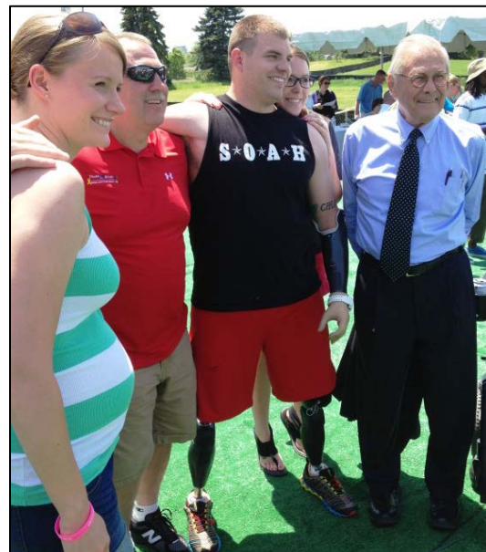
Don Rumsfeld at the Invincible Spirit Festival in May '13