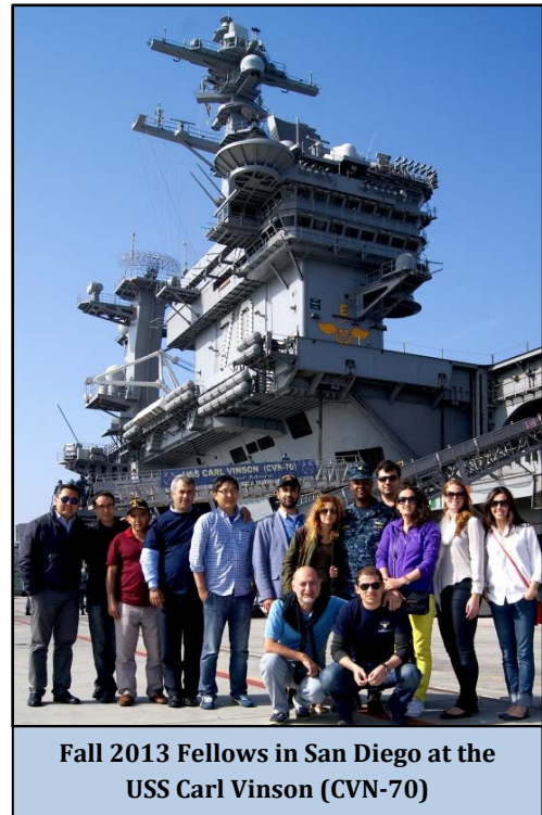
Fall 2013 Fellows in San Diego at the USS Carl Vinson (CVN-70)

This year we continued our important partnership with the Open World Leadership Center , which links our Fellows with host organizations in U.S. cities to enable them to learn more about local governments and communities while staying with host families. In the spring, half of the Fellows visited Charlotte, North Carolina, while others went to Kansas City, Missouri. At the conclusion of their Open World programs, the groups traveled to Atlanta, Georgia for a variety of meetings at Coca-Cola Headquarters. The fall Fellows also participated in Open World programs, traveling to Helena, Montana and Reno, Nevada. They then