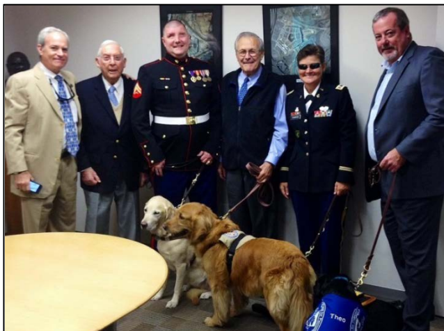
Paws for Patriots visiting the Rumsfeld Foundation in October '13

THE RUMSFELD FOUNDATION HAS DONATED MORE THAN $2.4 MILLION TO CHARITIES FOR OUR TROOPS, VETERANS, AND MILITARY FAMILIES SINCE 2007.