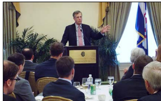
Conference Keynote Speaker, Brit Hume, Senior Political Analyst at FOX News

Following a welcoming reception at our home, there was a panel and a day of discussion which focused on the conference theme, “American Leadership – Tradition and Today.” Brit Hume, Senior Political Analyst at FOX News, spoke and responded to questions at the luncheon.