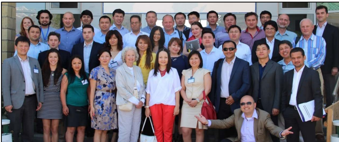
Conference Participants at the Karven Four Seasons, Issyk Kul, the Kyrgyz Republic

After successful conferences in 2012 and 2013, we are fully convinced of the value of providing opportunities for the alumni network to convene and are now in the early stages of planning the next regional Conference for the summer of 2014.