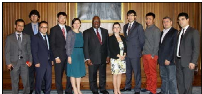
Spring 2013 Fellows with Justice Clarence Thomas