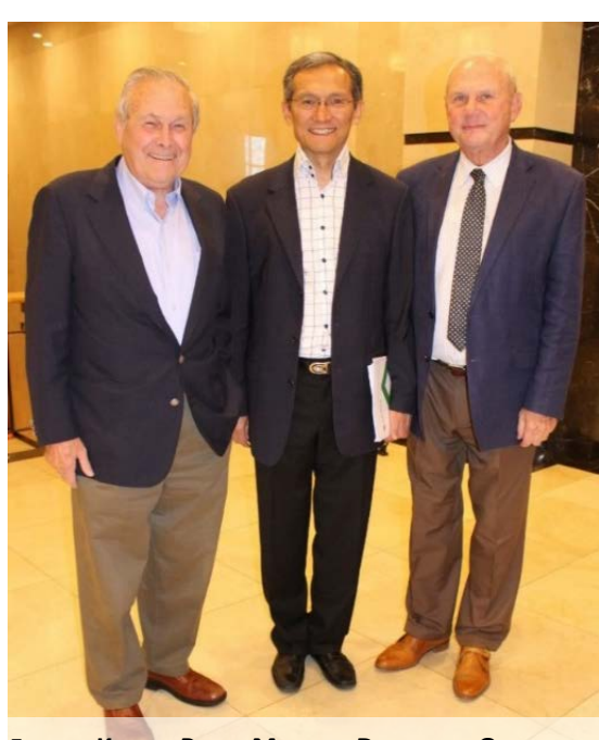
FORMER KYRGYZ PRIME MINISTER DJOOMART OTORBAEV