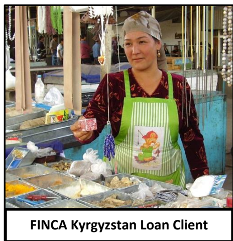
FINCA Kyrgyzstan Loan Client

In September 2011, we announced our microfinance grants totaling $225,000 to support microfinance projects in 10 countries. These grants included $20,000 to ACCION International , $25,000 to Grameen Foundation , $60,000 to Opportunity International , and $120,000 to FINCA International .