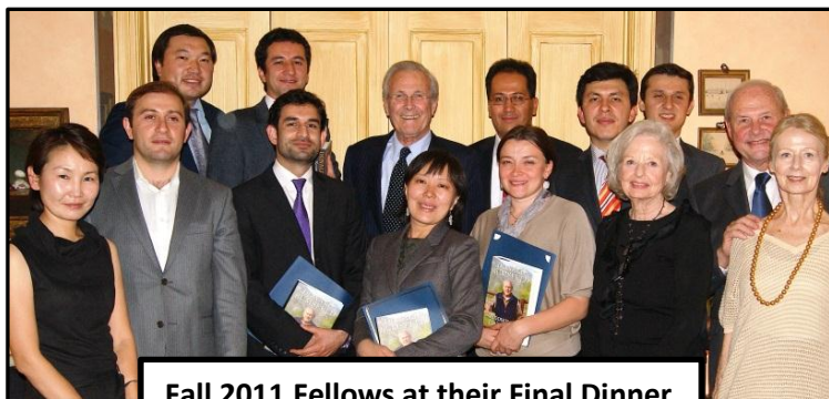
Fall 2011 Fellows at their Final Dinner

During their six week fellowship program they had over 60 meetings with a wide variety of U.S. business leaders, government officials, journalists, and academics. Meetings included time spent with such fine