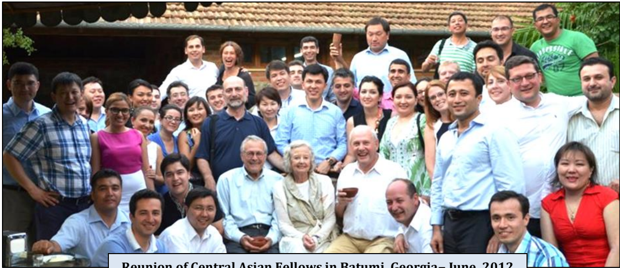
Reunion of Central Asian Fellows in Batumi, Georgia– June, 2012

From time to time, we receive requests for information on making a charitable contribution to the Rumsfeld Foundation. While we have not actively engaged in fundraising, we greatly appreciate the many who have donated through our website or by sending a check to our foundation office in Washington, D.C. Since the foundation was established in 2007, we have been fortunate to receive over $148,000 in donations from generous supporters. We are encouraged by the progress the foundation has made over the years and remain grateful for the assistance of others in helping us support the foundation's initiatives.