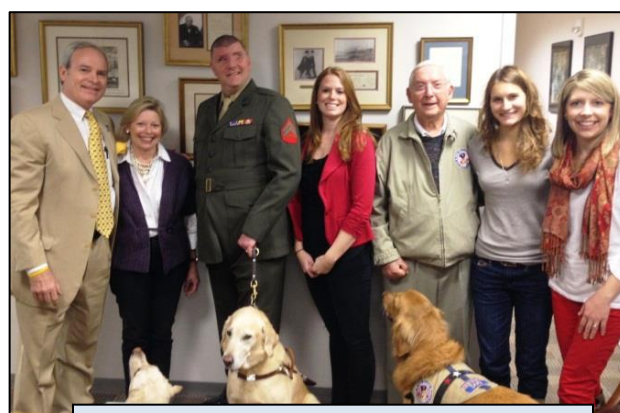
Paws for Patriots visiting the Rumsfeld Foundation in November 2012

This year funding was distributed among 36 organizations, all working to provide our troops, veterans, and their families with important support and services. The activities of these organizations range from fulfilling needs identified by troops on the ground and funding transportation for families to visit during a service member's hospitalization, to providing mentorship and career development counseling to veterans as well as funding educational grants for military children and spouses.