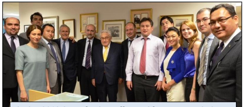
Spring 2012 Central Asian Fellows with Dr. Henry Kissinger

Joseph Lieberman (I-CT); General Richard B. Myers, former Chairman of the Joint Chiefs of Staff; Supreme Court Justice Clarence Thomas; Bob Zoellick, President of the World Bank, and many others. Over the course of the six week program, the fellows attended over 60 group meetings, along with the individual meetings many arranged in areas of their particular interests.