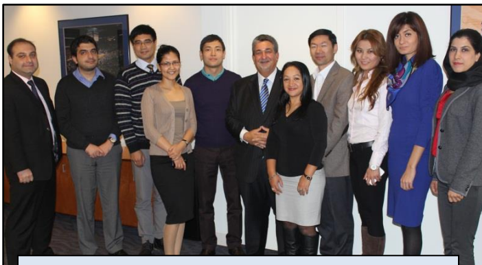
Fall 2012 Central Asian Fellows with Ted Leonsis

In October 2012, we welcomed 10 new fellows for our fall session with participants from Afghanistan, Armenia, Azerbaijan, Georgia, Kazakhstan, Kyrgyzstan, Mongolia, and Turkmenistan. This group included rising young leaders such as a businessman in the Kyrgyz technology sector, a Deputy Director of a Kazakh food and beverage company, a research fellow at an Azerbaijani think tank, and an international arbitration lawyer from Turkmenistan.