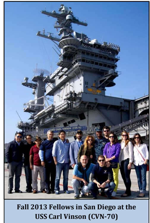
Fall 2013 Fellows in San Diego at the USS Carl Vinson (CVN-70)

This year we continued our important partnership with the Open World Leadership Center , which links our Fellows with host organizations in U.S. cities to enable them to learn more about local governments and communities while staying with host families. In the spring, half of the Fellows visited Charlotte, North Carolina, while others went to Kansas City, Missouri. At the conclusion of their Open World programs, the groups traveled to Atlanta, Georgia for a variety of meetings at Coca-Cola Headquarters. The fall Fellows also participated in Open World programs, traveling to Helena, Montana and Reno, Nevada. They then