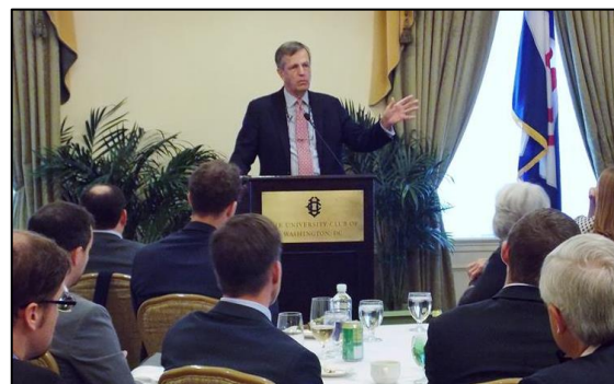
Conference Keynote Speaker, Brit Hume, Senior Political Analyst at FOX News

Following a welcoming reception at our home, there was a panel and a day of discussion which focused on the conference theme, "American Leadership – Tradition and Today." Brit Hume, Senior Political Analyst at FOX News, spoke and responded to questions at the luncheon.