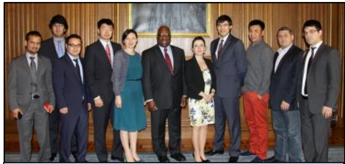
Spring 2013 Fellows with Justice Clarence Thomas