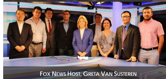
FOX NEWS HOST, GRETA VAN SUSTEREN