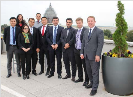
Fall Central Asia-Caucasus Fellows complete program from Sept 29 th – Nov 6 th