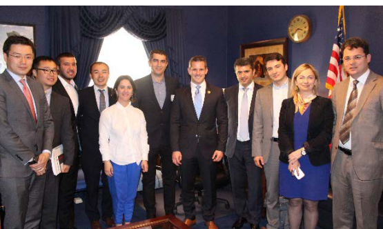
MEETING WITH CONGRESSMAN KINZINGER (IL)

Austin, TX Boise, ID Charleston, SC Ft. Worth, TX Riverside, CA Seattle, WA