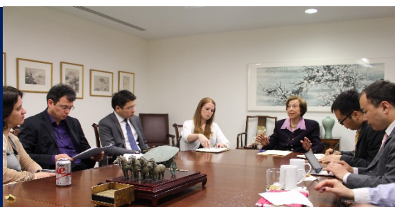
BRIEFING WITH AMB. CARLA HILLS, FORMER USTR AND SECRETARY OF HOUSING AND URBAN DEVELOPMENT