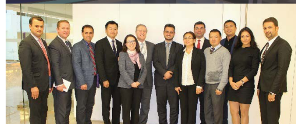
FORMER SECRETARY OF DEFENSE, WILLIAM S. COHEN