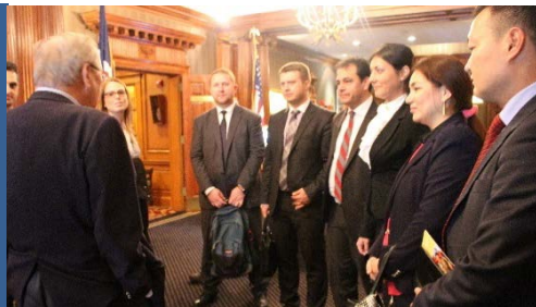
LUNCH WITH JOYCE AND DON RUMSFELD

"Spending 6 weeks in the U.S. with representatives of 10 nations makes the program even more vibrant. By the end of the program you feel as though you stayed not only in the U.S., but also in 9 other countries." - Ilgar Taghiyev, Azerbaijan