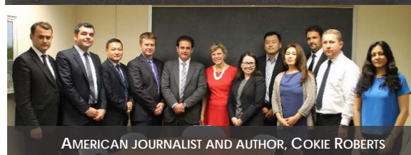
AMERICAN JOURNALIST AND AUTHOR, COKIE ROBERTS