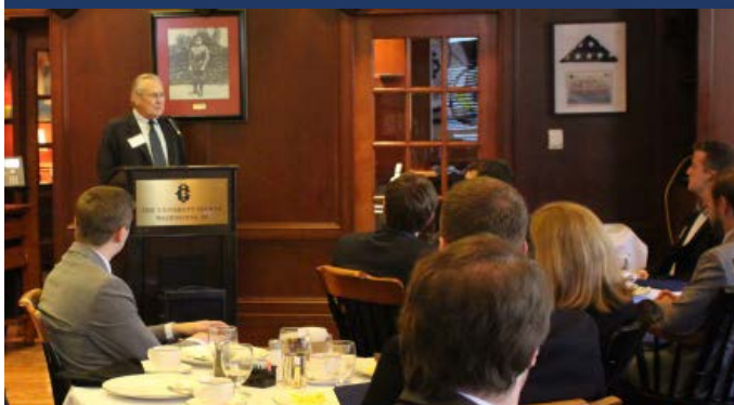
WELCOMING REMARKS BY DON RUMSFELD

"EVERY TIME I ATTEND THIS EVENT, I COME BACK BOTH INFORMED AND INSPIRED, WANTING TO PASS WHAT I LEARNED ON TO OTHERS." - UNIVERSITY OF CHICAGO FELLOW, 2010-2011