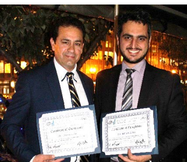
RECEPTION AT FINAL DINNER