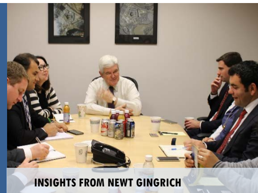
INSIGHTS FROM NEWT GINGRICH

U.S. Department of Defense U.S. Department of Energy U.S. Department of State U.S. House of Representatives