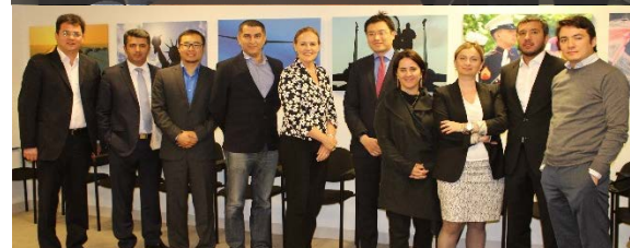
FMR UNDERSEC. OF DEFENSE FOR POLICY, MICHÉLE FLOURNOY