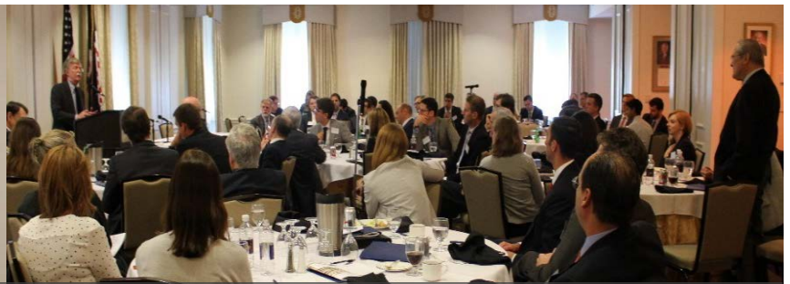
Q&A SESSION WITH AMB. BOLTON

"EVERY TIME I ATTEND THIS EVENT, I COME BACK BOTH INFORMED AND INSPIRED, WANTING TO PASS WHAT I LEARNED ON TO OTHERS." - UNIVERSITY OF CHICAGO FELLOW, 2010-2011