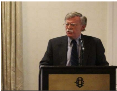
KEYNOTE SPEAKER, AMB. JOHN BOLTON

In addition to the plenary sessions, Fellows participated in breakout discussions facilitated by Advisers, providing a further opportunity to reflect on the day's theme with their colleagues. The Conference concluded with a reception and dinner including closing remarks from the President of the Foundation, Don Rumsfeld.