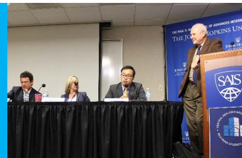
FINAL PRESENTATIONS AT CACI, JHU-SAIS

"Bringing CAMCA in from the Cold: Possible Scenarios"