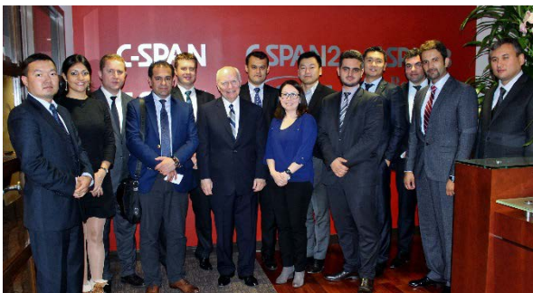
TOURING C-SPAN STUDIOS WITH CHAIRMAN, BRIAN LAMB