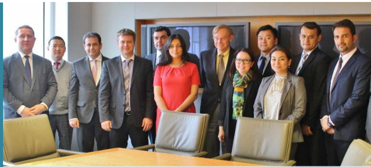
MEETING WITH BOB ZOELICK, FORMER PRESIDENT OF THE WORLD BANK GROUP