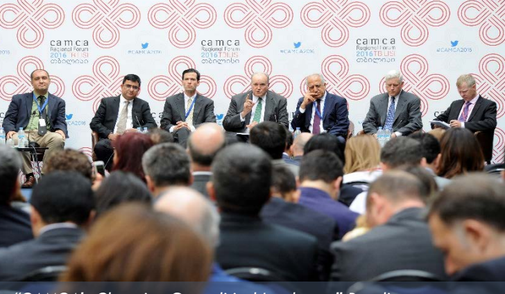
"CAMCA's Changing Geopolitical Landscape" Panelists