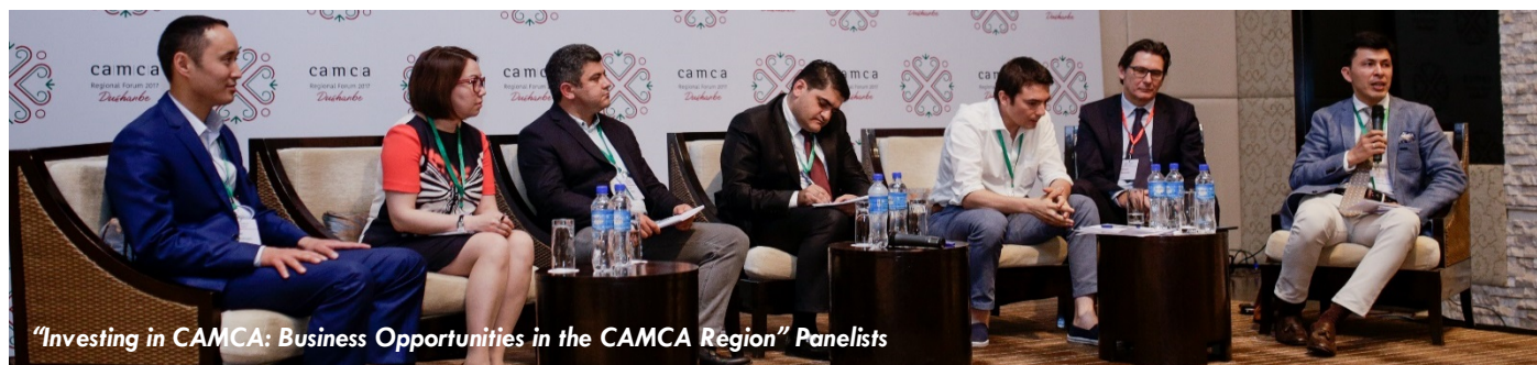
“Investing in CAMCA: Business Opportunities in the CAMCA Region” Panelists