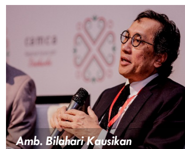
Amb. Bilahari Kausikan