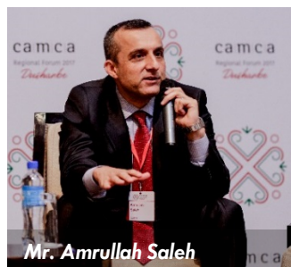
Mr. Amrullah Saleh