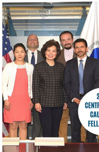
2019 CENTRAL ASIA- CAUCASUS FELLOWSHIP