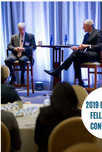
2019 GRADUATE FELLOWSHIP CONFERENCE