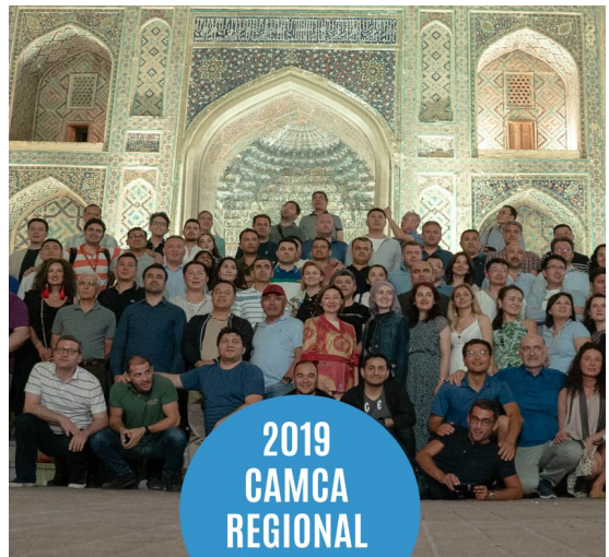
2019 CAMCA REGIONAL FORUM