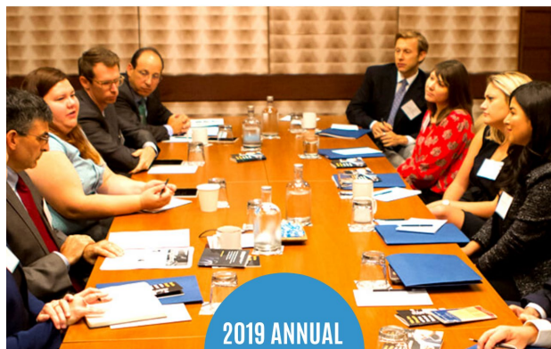
2019 ANNUAL CONFERENCE

The Graduate Fellowship Program continues to support scholars of outstanding intellectual ability, integrity, moral character and leadership that are nominated by the talented professors across the country serving as our program Advisers. For the 2019-20 academic year, an impressive group of 20 Fellows were awarded financial grants in the form of tuition and stipend support. Graduate Fellowships assist scholars pursuing Master's and doctoral degrees, postdoctoral research and public service internships . Beyond the financial assistance provided, the Foundation continues to cultivate connection and collaboration across the growing network of current and former Fellows as they navigate their careers and hosted several events toward that end in 2019.