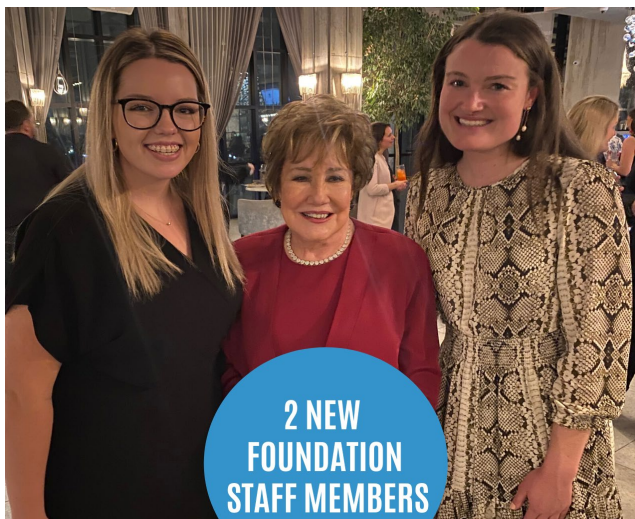
2 NEW FOUNDATION STAFF MEMBERS